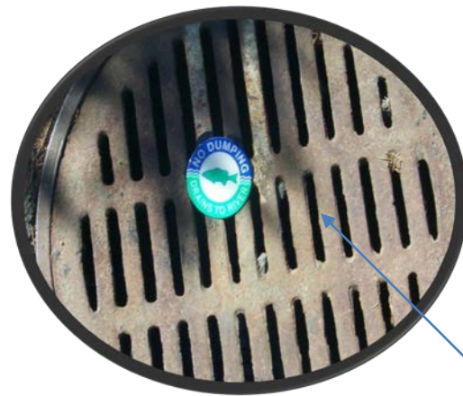
Stormwater Catch Basin

Oil and other vehicle fluids can be disposed of free at the Whitman County Transfer Station Household Hazardous Waste Facility.